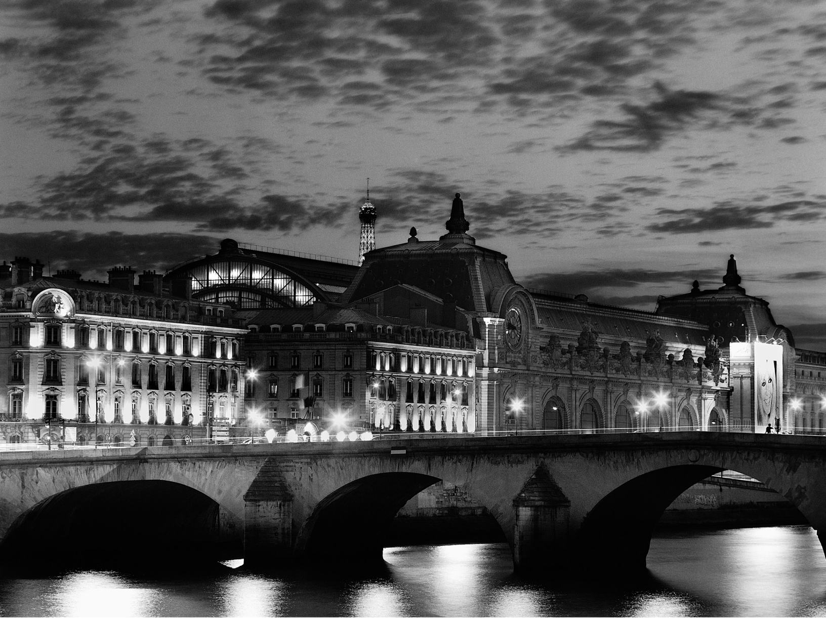
▲ Pont Royal