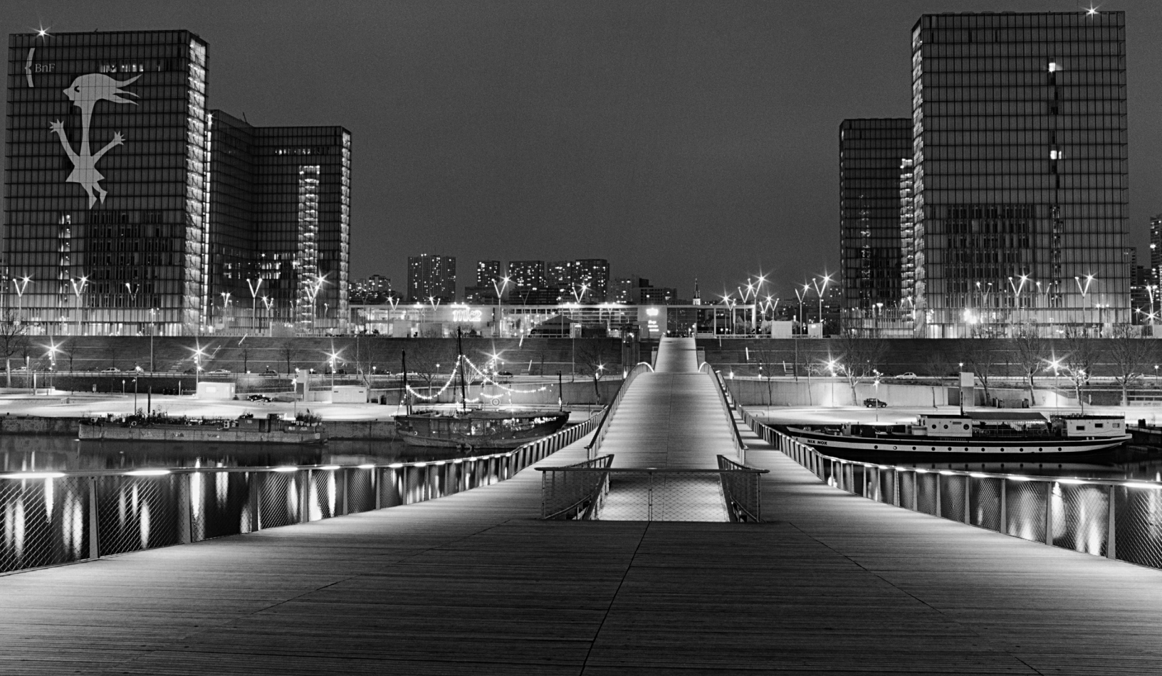
^ Passerelle Simone de Beauvoir

Sometimes in life, tiny mistakes turn into tremendous opportunities. Such is the case for photographer Gary Zuercher, as a slight error in the processing of a single photograph led to an unprecedented Parisian photography project.